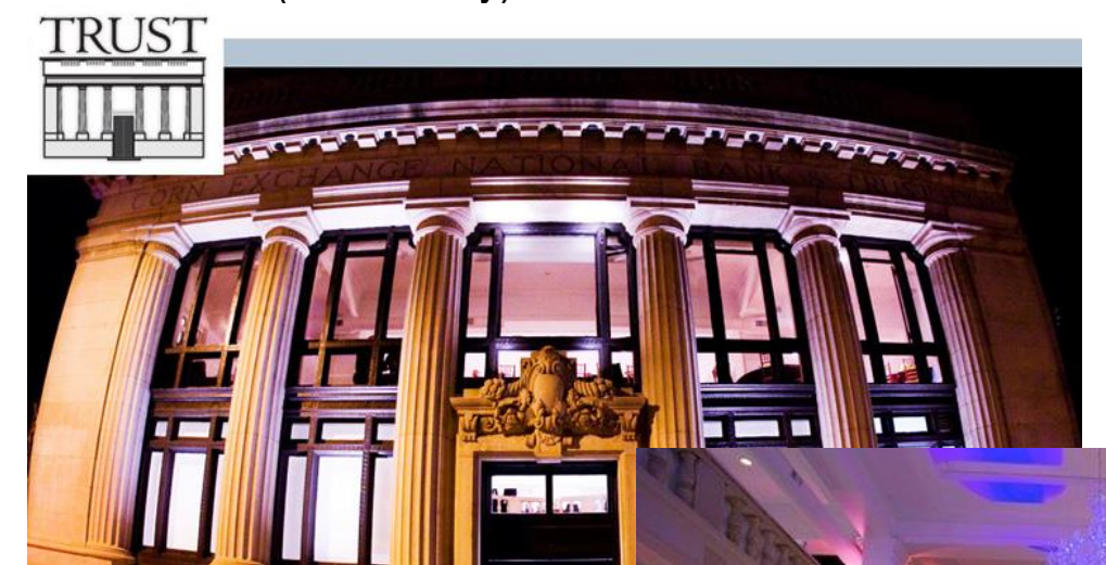
249 Arch Street, Philadelphia